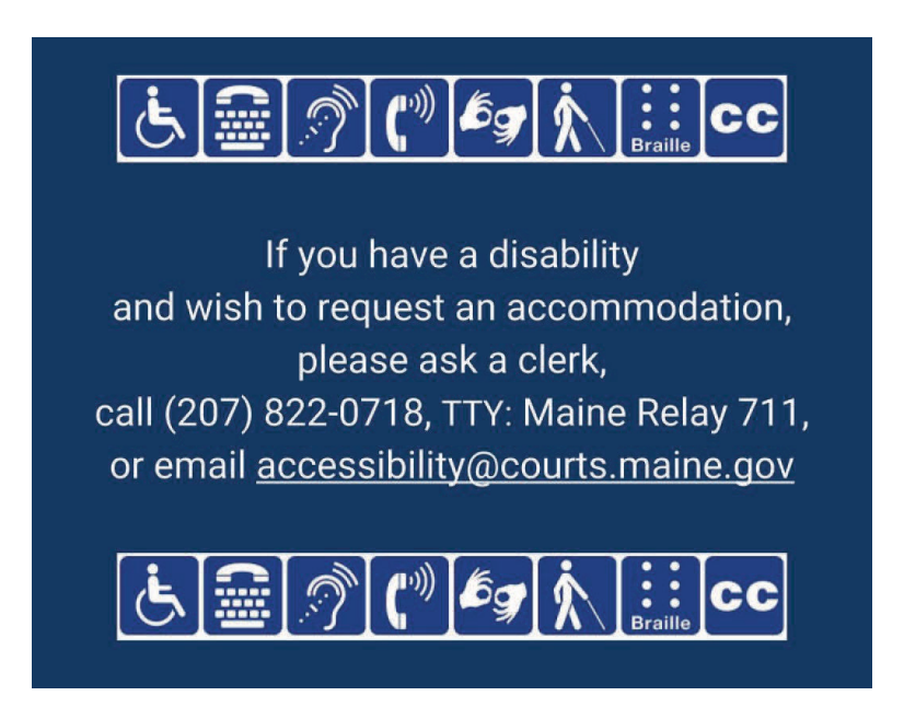
Figure 3. Judicial Branch Disability Accommodations Sign.