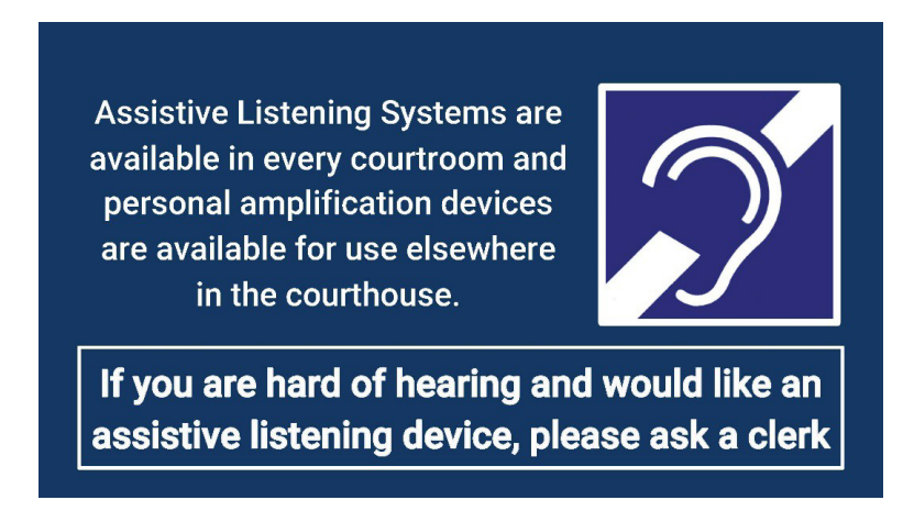
Figure 4: Judicial Branch Assistive Listening System Sign

Every courthouse in Maine has signage to notify the public that the courts provide assistive listening and to ask a clerk for assistance. See Figure 4. Judicial Branch Assistive Listening Sign.