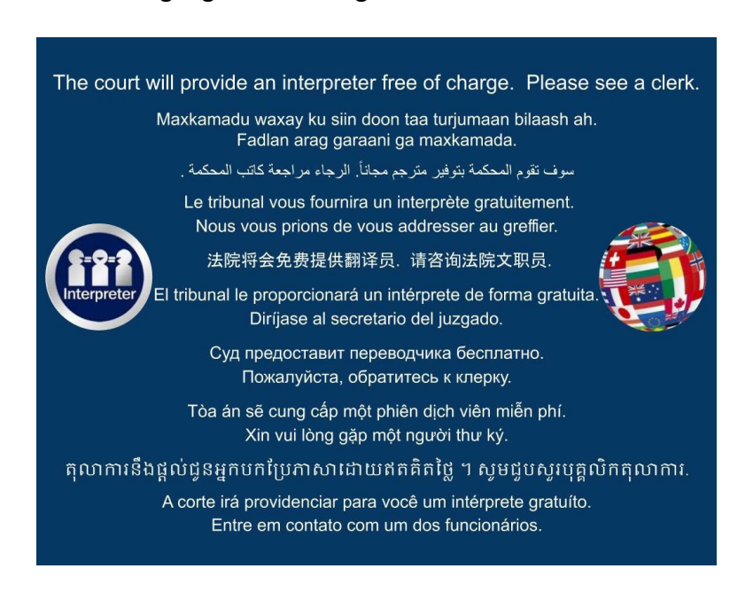
Figure 2. Judicial Branch Language Services Sign.

See Figure 2. Judicial Branch Language Services Sign.